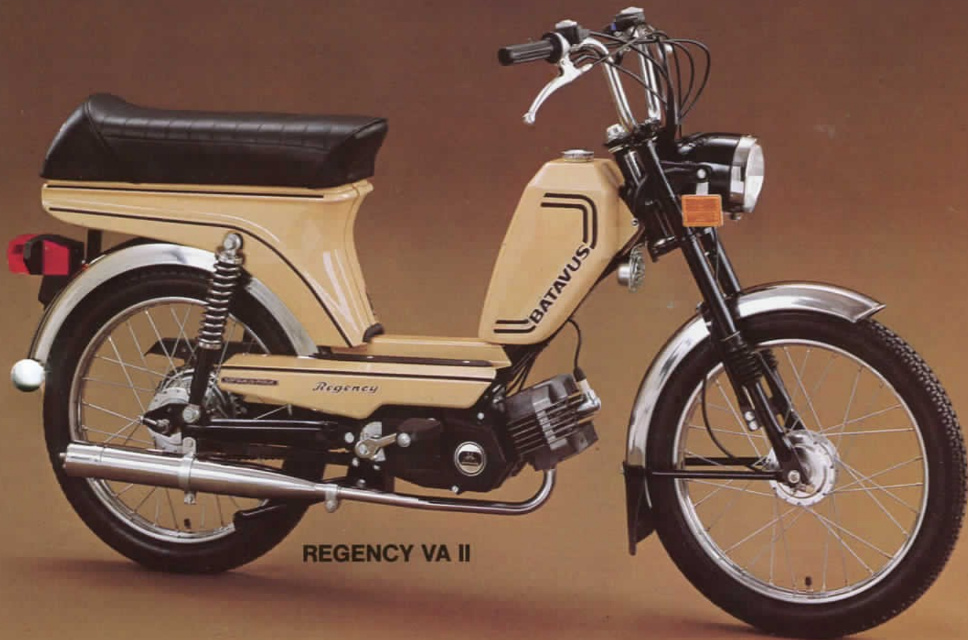
REGENCY VA II