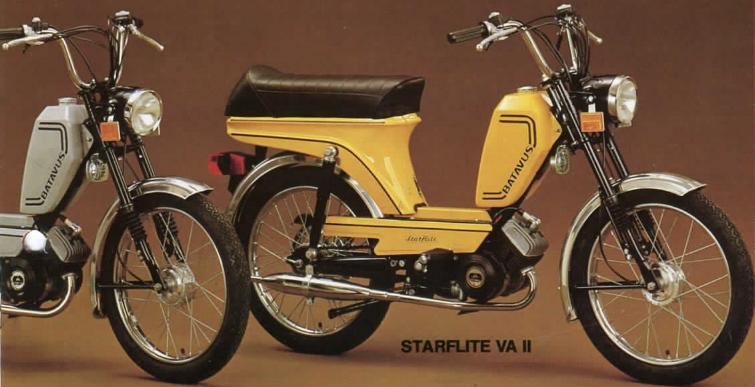
STARFLITE VA II